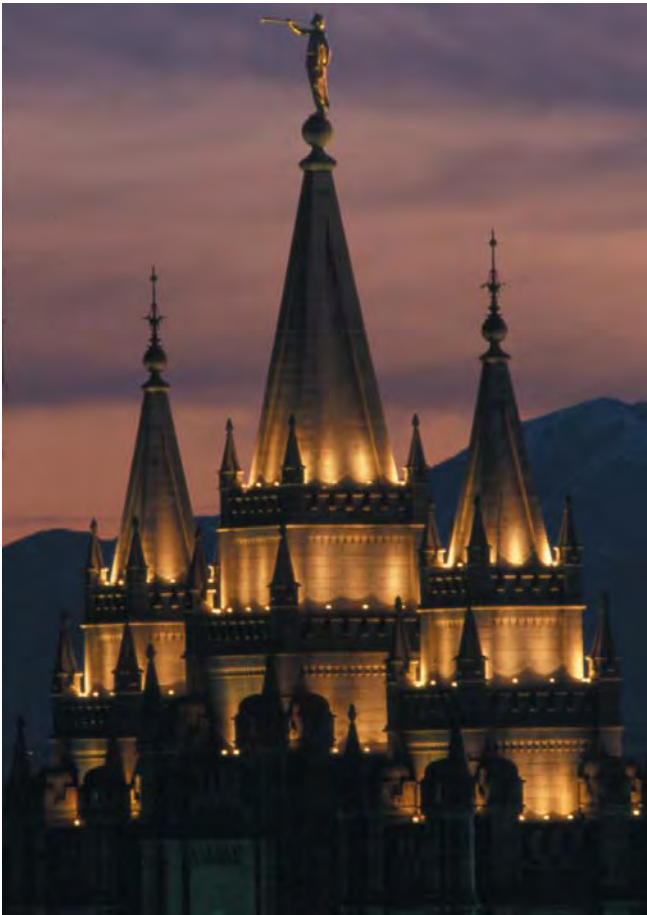
Salt Lake Temple Spires